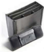
IM2435-DIV-LIDORG Divider Set & Lid Organizer